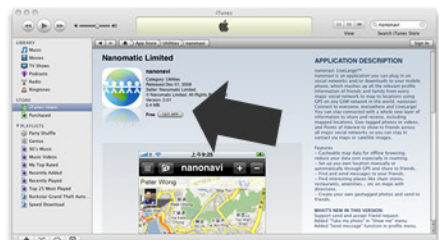
iPhone/iPod touch user please download from iTunes Application Store