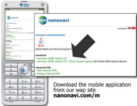
Download the mobile application from our wap site nanonavi.com/m