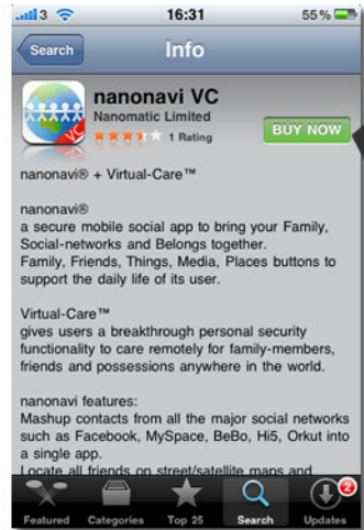
Download nanonavi from iPhone.