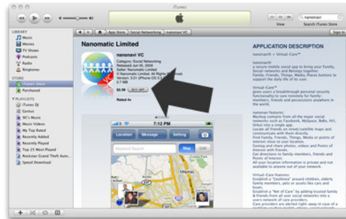
Download nanonavi on iTunes.

Download our iPhone application from iTunes or click App Store on your iPhone. Search nanonavi VC and click "BUY NOW" . The application will automatically download, sync/install to your iPhone.